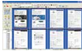
The AVScan X main screen

The Intelligent Document Management Tool