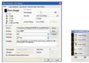
The Button Manager V2 main screen

Button Manager V2 makes it easy for you to scan and send your image to your favorite destinations with a press one button. Now the new version comes with an innovative feature to let you scan and automatically upload the scanned document to popular cloud repositories such as Google Docs, Microsoft SharePoint or FTP. In addition, the iScan feature allows you to insert the scanned image or recognized text after optional OCR (Optical Character Recognition) process to your text editor such as Microsoft Word to get your job done easily and quickly.