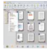
The PaperPort SE14 main screen

- The Professional Choice to Organize and Share Your Documents