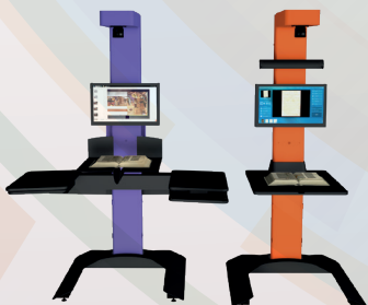
EXAMPLES OF WALK-UP CONFIGURATION, KIOSK FOR SELF-SERVICE USE