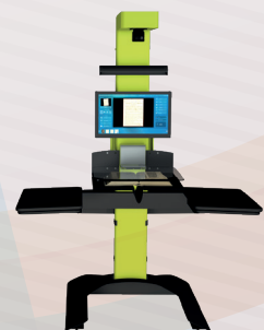
EXAMPLE OF WORKING STATION CONFIGURATION, SCANNER'S FEET LIE ON THE FLOOR FOR A SEATED USE