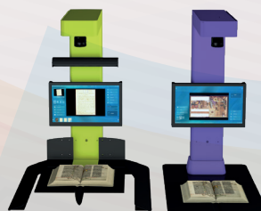
EXAMPLES OF TABLE TOP CONFIGURATION, TO BE INSTALLED ON YOUR OWN TABLE