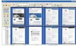
The AvScan 5.0 main screen

Document Imaging is the very first step of Document Management. However, poor quality images can cause serious problems to later indexing or storing processes. It may increase scanning labour costs and lowers the OCR accuracy. AvScan 5.0 ensures all documents are checked and polished at the time they are scanned such that the image quality is guaranteed before they are ready to use for other purposes.