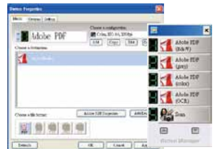
The Button Manager main screen

Avison's state-of-the-art software application, the Button Manager, enables you to complete complex scanning task in just a single step. When the button is pressed, the scanner automatically scans your documents and converts them to a highly compressed file format, Adobe searchable PDF, or other image formats, and then sends the file to a designated folder, or other destination applications such as e-mail, printer, or your favorable software application. The original step-by-step procedure is replaced with only a single touch of the button.