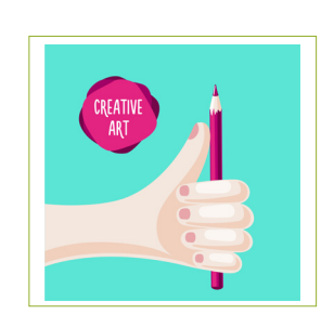
Scan your large fragile documents, textiles or artwork