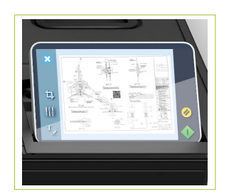
Control the entire scan process from the IQ FLEX built-in touchscreen computer.

Operate from the touch panel or install the Nextimage software and run it from a PC or simply use rainforest365. Scan to any PC via Ethernet or Wi-Fi with the revolutionary Contex LINK pc utility.