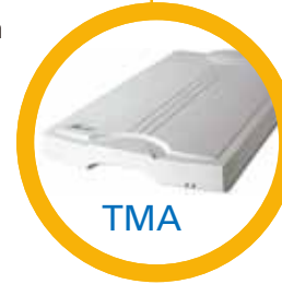
Transparent Media Adapter

Plus, one Smart-touch button (SCAN) located at the front of the scanner provides you with a quick and easy access way to capture images that can be automatically saved as files or sent to another application for further processing later.