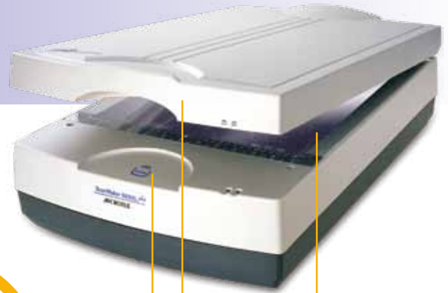
A3 Scan Bed